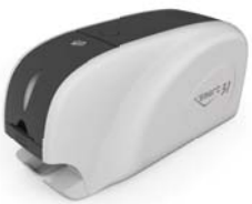
Single sided ID CARD PRINTER smart-31 S